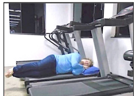
My doctor asked me to spend at least one hour each day on the treadmill.

John the Baptist went through the same ordeal with the representatives of religious leaders who were out to get him. He was burning inside with a message of repentance and openness to the power of God, and all the religious leaders wanted to know was what religious camp he was in. They weren't true seekers trying to broaden their own understanding. Instead, they were cowards who wanted to diminish this passionate prophet by reducing him to a label. GPBS eNews