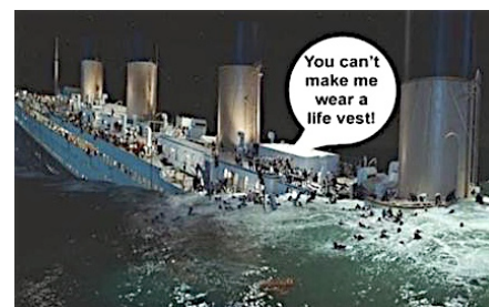
If people from 2020 were on the Titanic